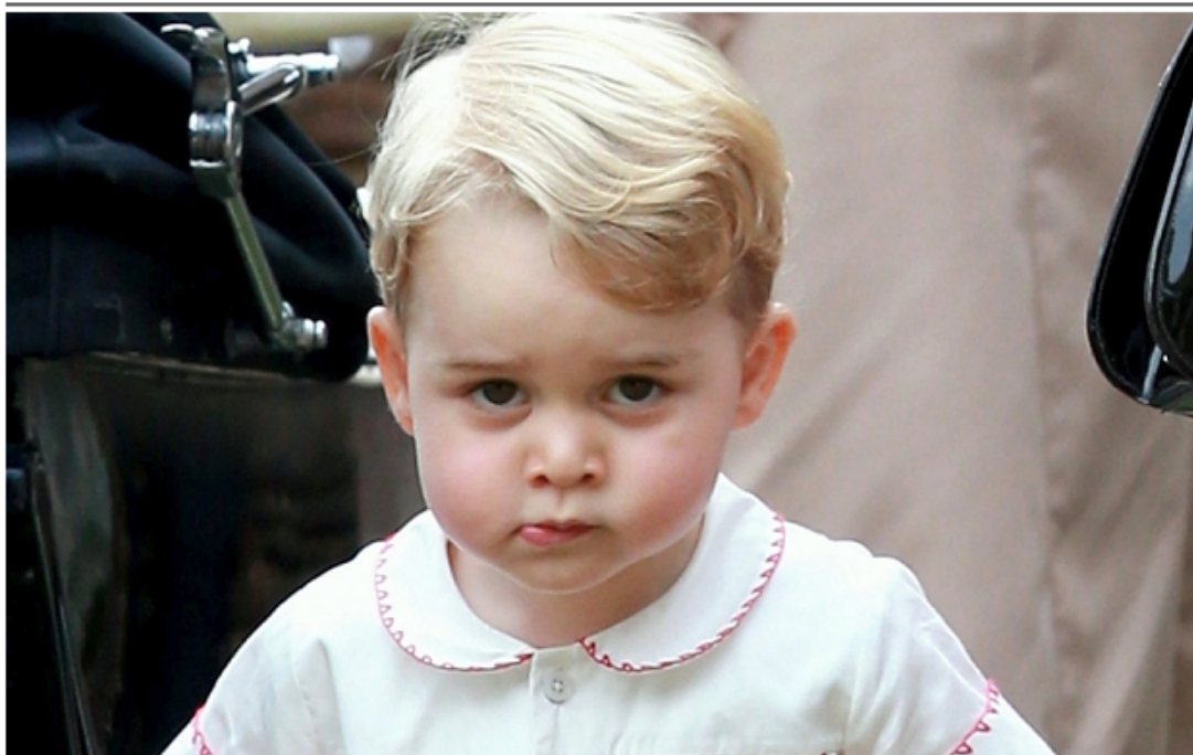
Prince George